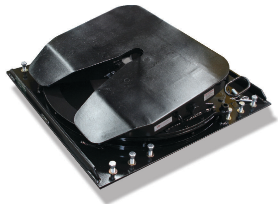
Maxi 50 on single row ballrace